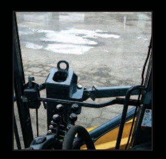
View from Cab